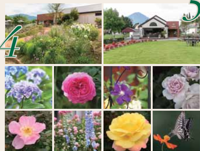
The flowering conditions of the garden flowers differ depending on the season, climate, etc.

View Mt. Fuji here in Muse Garden, surrounded by mountains and facing Lake Kawaguchi. Enjoy a walk after watching the dolls in this small English garden where roses and perennials bloom.