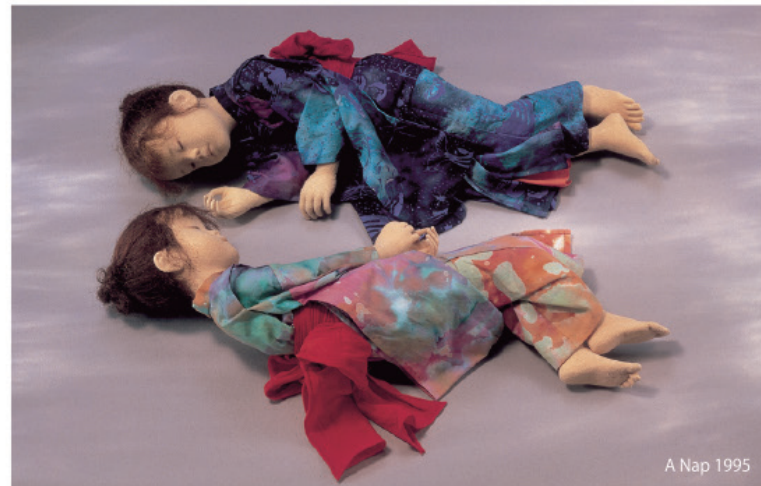
A Nap 1995