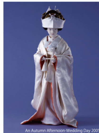
An Autumn Afternoon-Wedding Day 2005